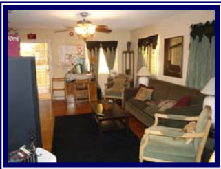
A place to adjust and get ready for life...

Access to licensed & certified nursing staff that have a cultural sensitivity to the individual needs.