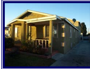
Advocates for better citizens...

Premier Transitional Care— A licensed supporter of youth