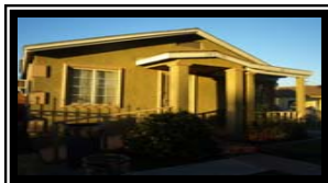
Premier Transitional Care House

Additionally, for a young person that has already been 'labeled', the intent is to intervene through counsel, testing and use of creative programs that provide motivation to change.